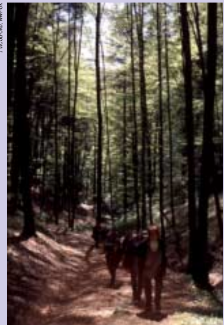
Walking in the forest, Carpathian Mountains, Romania.

Irrespective of the type of product on offer, each component should be the subject of a carefully prepared business plan. This should develop the market assessment and marketing approach, cover practical details of delivery, address personnel and responsibilities, and include a full costing and risk assessment. Environmental impact assessments should also be undertaken as referred to under Guideline 6.