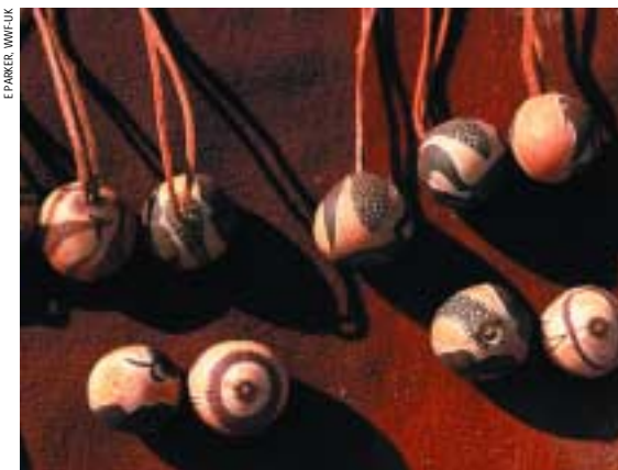
Necklaces made from palm fruits by Himba women for sale in the 'Traditional Village' Purus Conservancy, Namibia.

Many WWF-supported ecotourism projects have considerable experience of training, especially those in Namibia (see p.7) and Brazil (see p.9).