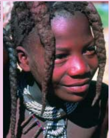
Himba Girl, Namibia.