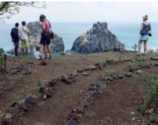
Tourists at the Marine National Park, Fernando de Noronha, Brazil.