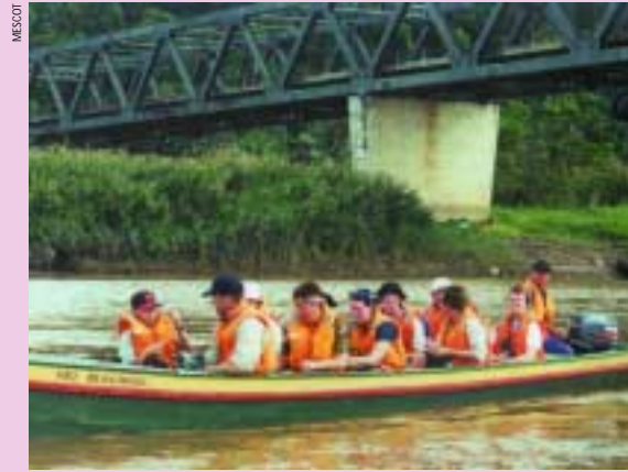
Village boat service for tourists in Sabah, Malaysia.

MESCOT has led to heightened concern about the dwindling forest resources in the area. The development of interpretative trails by the local community has raised their interest and awareness of the richness of the biodiversity. Participation in tourism has encouraged clearance of rubbish, local landscape improvements and a forest rehabilitation programme, sometimes involving visitors themselves.