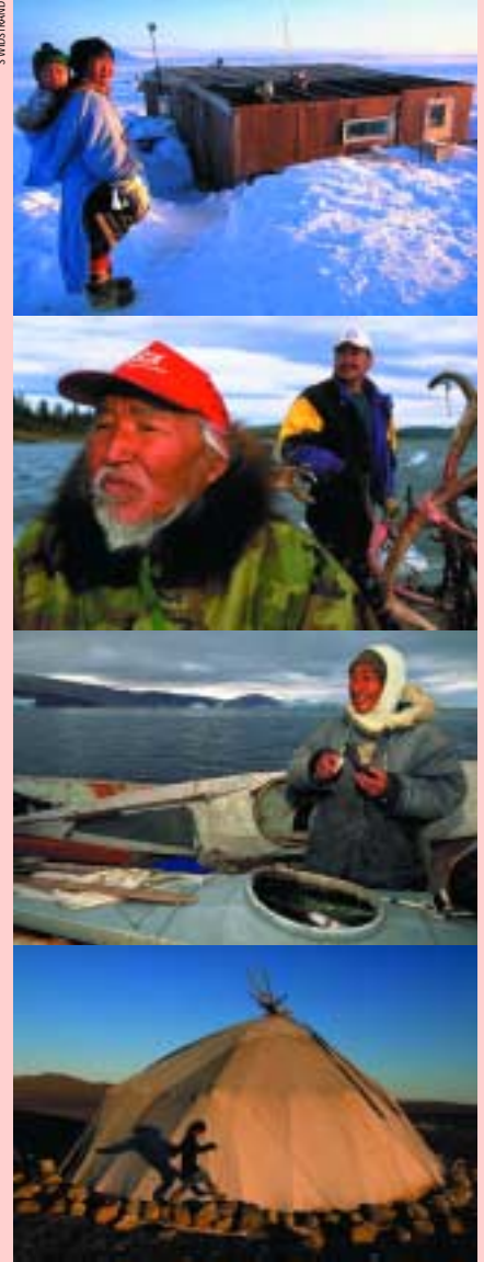
Local community members in the Arctic.