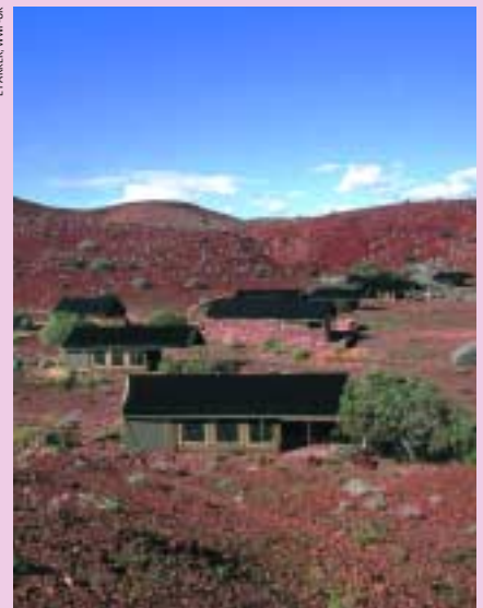
Damaraland Camp – an ecotourist lodge in the Torra Conservancy, Namibia.