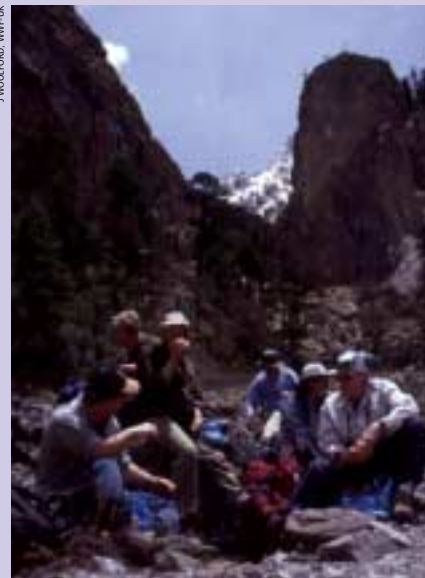
Above left: Ecolodge, Wanglang reserve, Pingwu County, China.