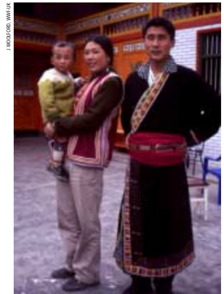
Baima 'Homestay' owners, Yazhe Village, Pingwu County, China. After a recent logging ban it is hoped that tourism can provide an alternative income for Baima people. Tourists on the way to Panda reserves can stay in these homestays.

This is the challenge for WWF and all parties involved in ecotourism. These guidelines attempt to assist field project staff to make informed decisions in meeting this challenge.