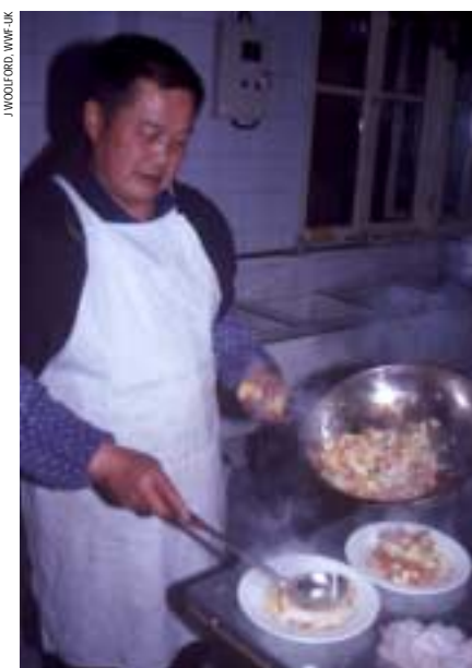
Chef preparing delicious spicy Sichuan food at Wanglang ecolodge, Pingwu County, China.