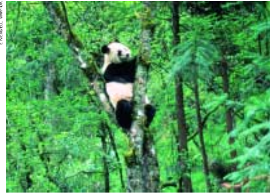
Giant Panda in its natural habitat, Sichuan Province, China.